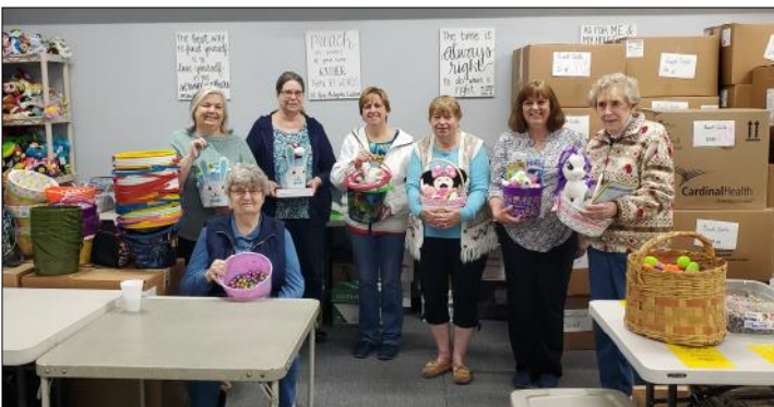
Some Holy Cross members helped create Alleluia baskets. See April Koinonia for more details.

Church Leadership met on Mon., March 23, to plan for how we as Holy Cross move forward in ministry in the midst of the Coronavirus outbreak, the call for social distancing, and limiting groups to 10.