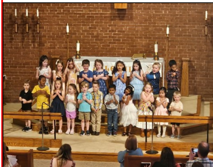
Three- and Four-year-olds sing "Jesus in the Morning."

The preschool year has flown by so quickly! The children have grown so much, and we are proud of their accomplishments. We had a wonderful End of Year Celebration.