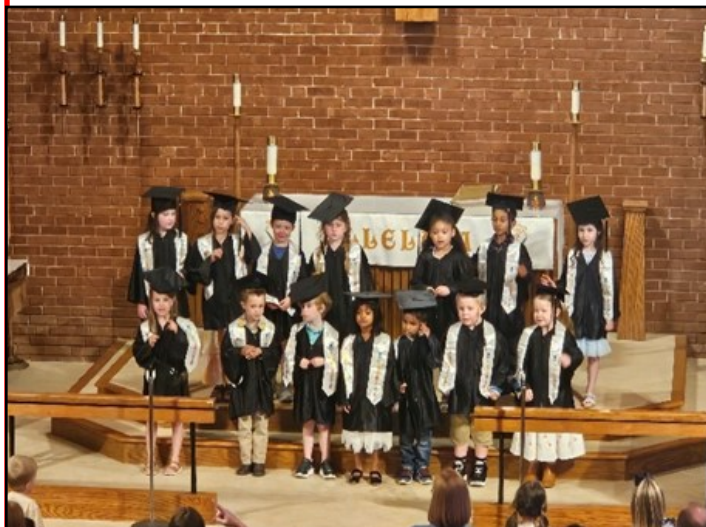
The Four-year-olds sing their graduation song.