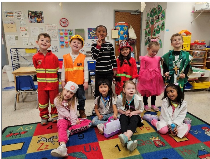
Four's Career Day

The preschoolers invite you to join us for a special Candy Cane Christmas service on Dec. 7 at 3PM. The children will gather in the Welcome Center at 2:50PM. Parents and family may then have a seat.