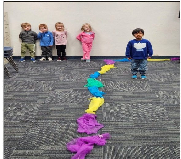
Three's Thankful Scarfs.