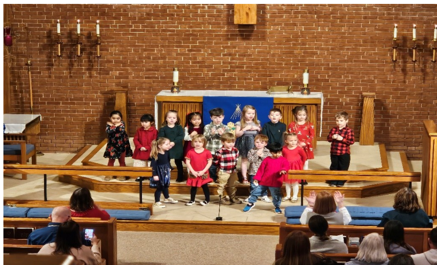
"Candy Cane Christmas Program"